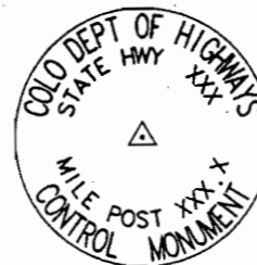
Typical Control Monument Cap Not to Scale

BASIS OF BEARING: Bearings used in the calculations of coordinates are based on a grid bearing of N 17°00'09" W from SH83 CM-MP 50.5 and SH83 CM-MP 50.6 as obtained from a Global Positioning System (GPS) survey based on the Colorado High Accuracy Reference Network (CHARN).